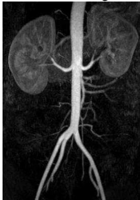
Normal renal arteries MRA with contrast