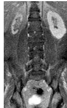
Atrophied Right Kidney

Magnetic Resonance Angiography without contrast identifies diseased arteries, to guide treatment and intervention, aid treatment of high blood pressure, and preservation of kidney function.